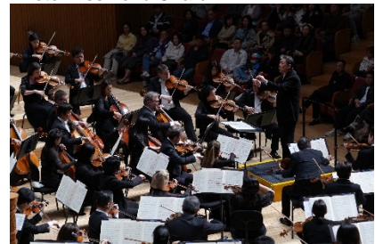
6. Harbin Concert Hall