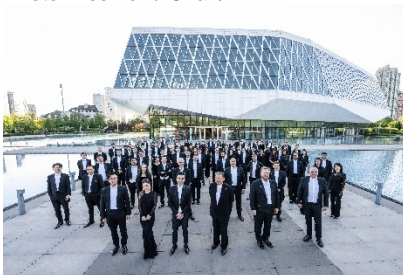
7. Harbin Concert Hall