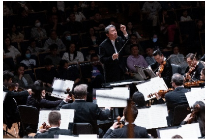
11. Shenyang Shengjing Grand Theatre