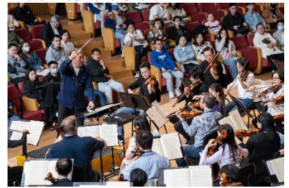
9. Joint open rehearsal with the Harbin Symphony Orchestra