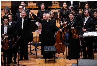
4. Wuhan Quintet Concert Hall