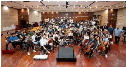
13. Long Yu and the orchestra's Principals visit the Central Conservatory of Music and conduct masterclasses