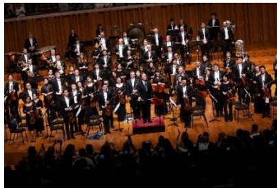
14. Beijing National Centre for the Performing Arts