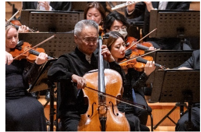
3. Jian Wang performs at Shanghai Oriental Art Center