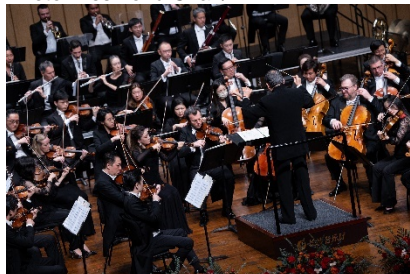
5. Changsha Concert Hall