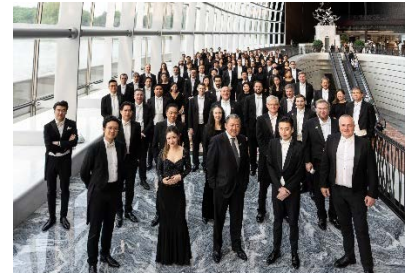
12. Beijing National Centre for Performing Arts